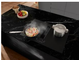
Photo 1: The induction hob with integrated extractor fan TwoInOne (KMDA 7876 FL) with matt finish has a sophisticated look and feel and is resistant to scratches. Another benefit of the textured surface with anti-fingerprint effect is that fingerprints are virtually invisible. On top in the 125 Gala Edition: a free guarantee extension of 125 weeks.