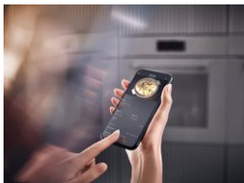
Photo 2: A camera keeps a constant eye on food as it cooks and, where needed, allows temperatures and cooking times to be adjusted from a smartphone: To this end, users of this intelligent oven from the Generation 7000 series of Miele built-in products don't even need to be in the kitchen; they can be attending to their guests. (Photo: Miele)

Photo 1: The new Generation 7000 built-in appliances from Miele are intuitive in use and make life a lot simpler! The photograph shows a combination of products from the handleless ArtLine series in graphite grey. (Photo: Miele)