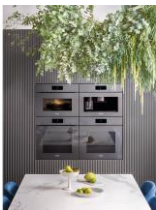
Photo 1: The new Generation 7000 built-in appliances from Miele are intuitive in use and make life a lot simpler! The photograph shows a combination of products from the handleless ArtLine series in graphite grey.

There are three photographs with this text