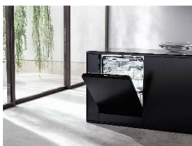
Photo 1: The new G 7000 dishwashers from Miele offer exceptional performance and convenience thanks to the automatic dispensing system AutoDos with integrated PowerDisk. Connected via WiFi, these dishwashers can be controlled from a mobile device and the new AutoStart app-based function (launch in 2Q19) offers complete freedom by facilitating a regular start at pre-set times.