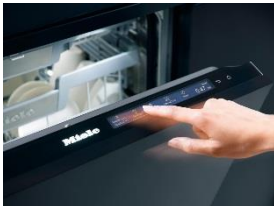
Photo 3: Premiere for M Touch on fully integrated dishwashers. Programmes can be selected by tapping, dragging or swiping – simply and intuitively.

Text and photo download: www.miele-presse.de