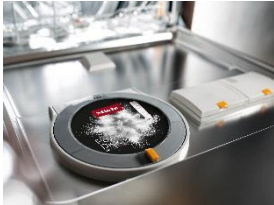
Photo 2: The PowerDisk is located in a special device on the inner door face and is fitted both quickly and easily. Detergent is dispensed automatically as the disk turns 360° during a programme cycle.